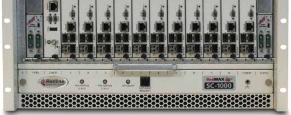
RedMAX 4C™ SC-1000 Mobile WiMAX Base Station

One such product is the RedMAX 4C SC-1000 Mobile WiMAX Base Station, a carrier-grade mobile WiMAX base station for broadband wireless services based on the IEEE 802.16e mobile WiMAX standard. When he and his colleagues first envisioned this product—Rayal explains—they knew they wanted the flexibility to operate in diverse wireless frequencies and to support a wide range of mobile devices, the scalability to support a high data throughput and hundreds of subscribers, and a price point to make the product attractive to their highly cost-sensitive markets. With these goals in mind, they set out to find the technology and development support that would enable them to meet these requirements in a timely and cost-efficient manner.